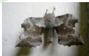
Poplar Hawkmoth found at Jerusalem Farm

So feel free to come along and see what is flying around Ogden during the night.